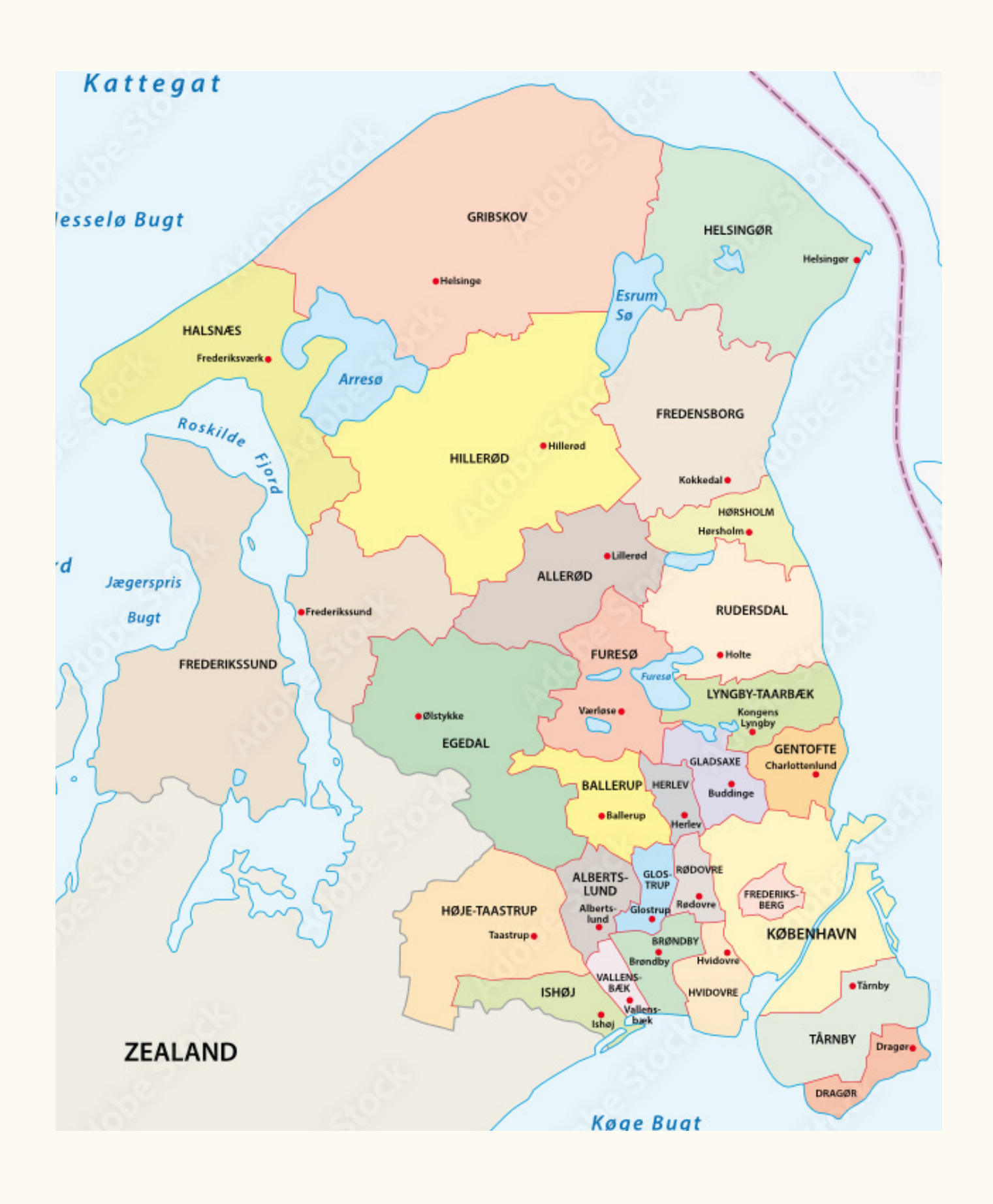
TIER 1: København, Frederiksberg & Tårnby